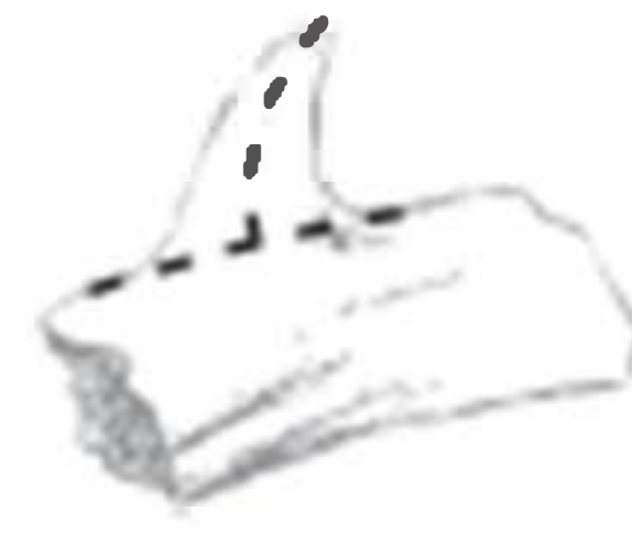
Detail of Point Measurement